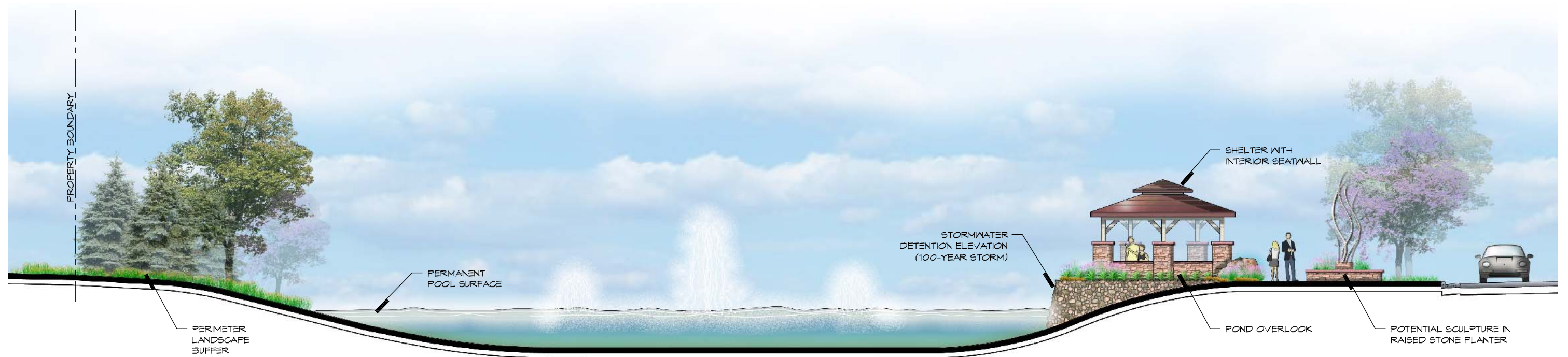
Potential Water Feature and Overlook